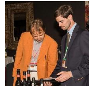
Previous years events